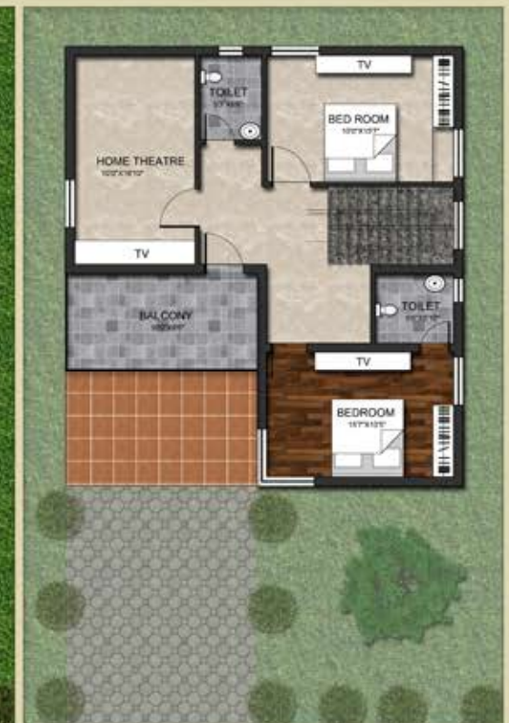
WEST - First Floor