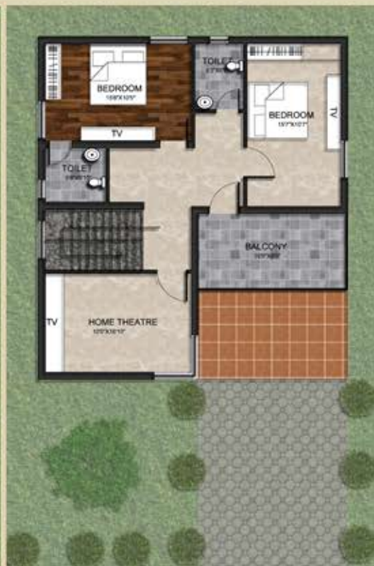
EAST - First Floor