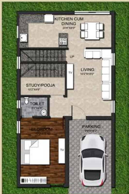
SOUTH - Ground Floor