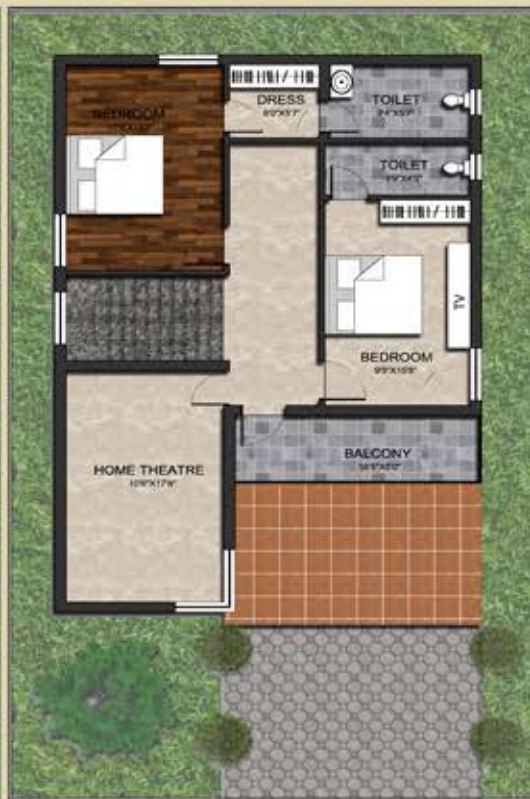
EAST - First Floor