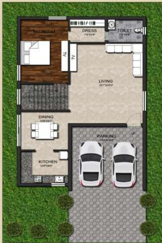
EAST - Ground Floor