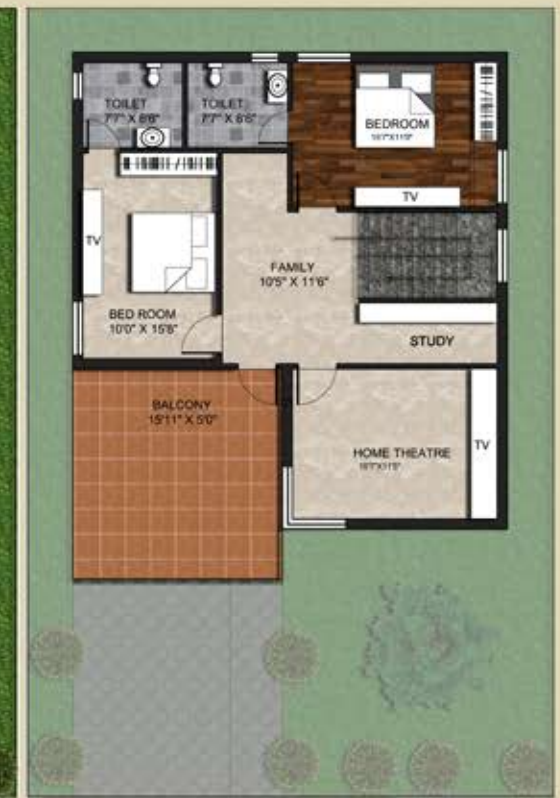
NORTH - First Floor