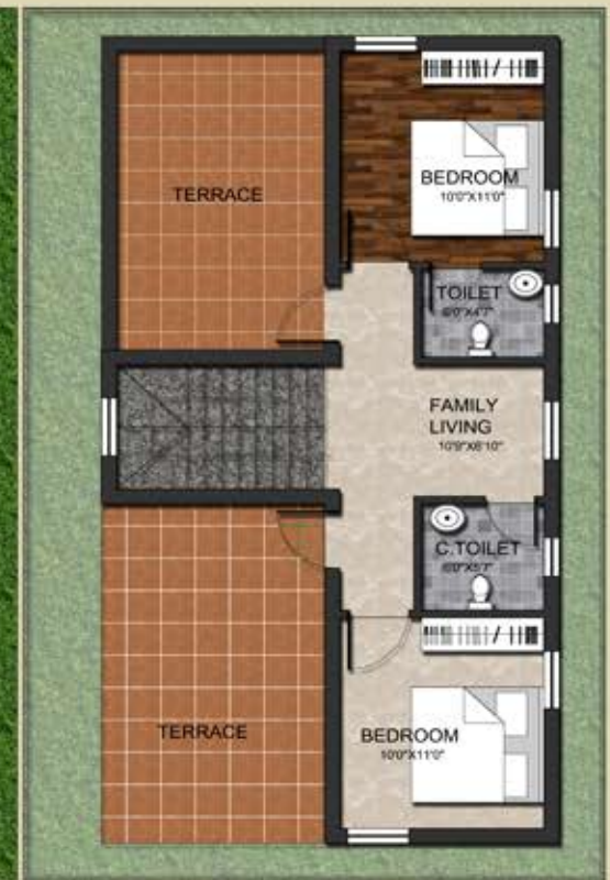
NORTH - First Floor