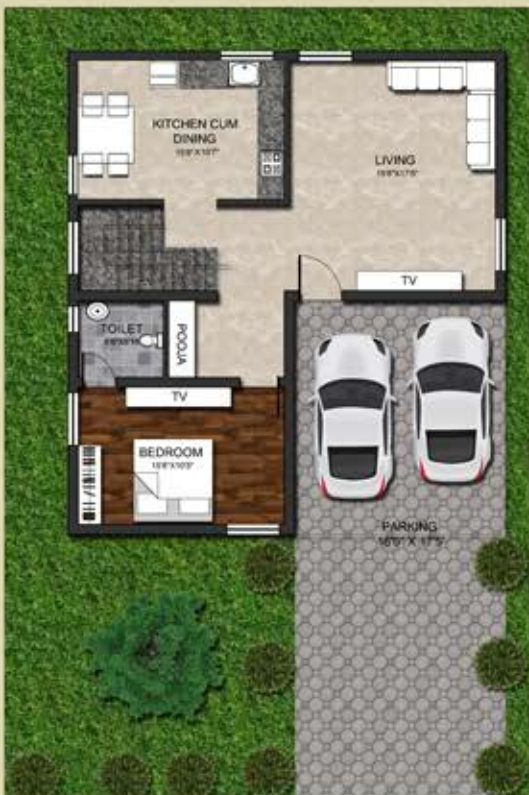
SOUTH - Ground Floor