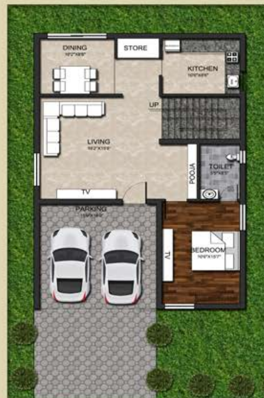
WEST - Ground Floor