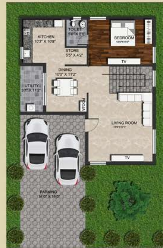
NORTH - Ground Floor