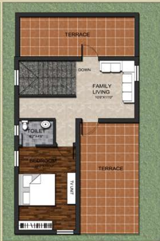
SOUTH - First Floor