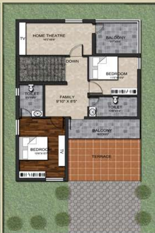
SOUTH - First Floor