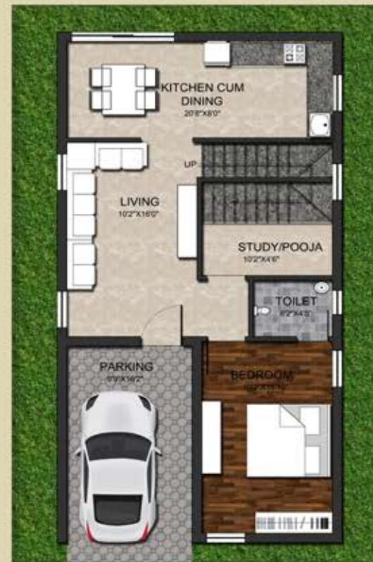
WEST - Ground Floor