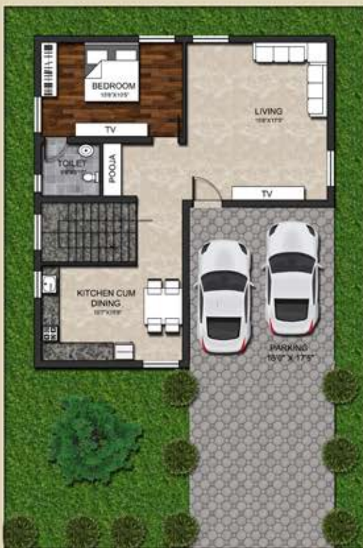
EAST - Ground Floor