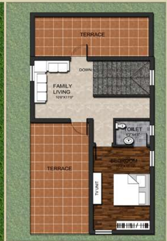
WEST - First Floor