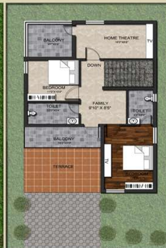
WEST - First Floor