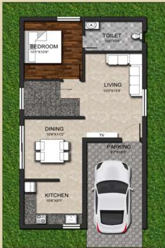
EAST - Ground Floor