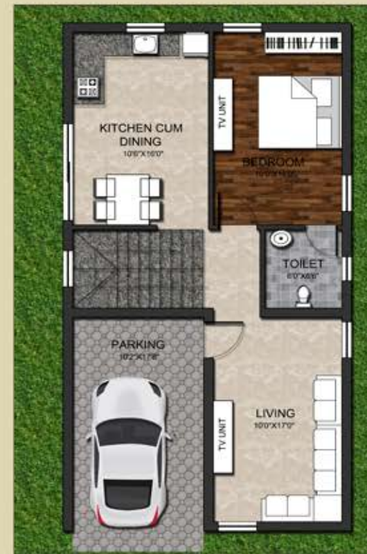
NORTH - Ground Floor