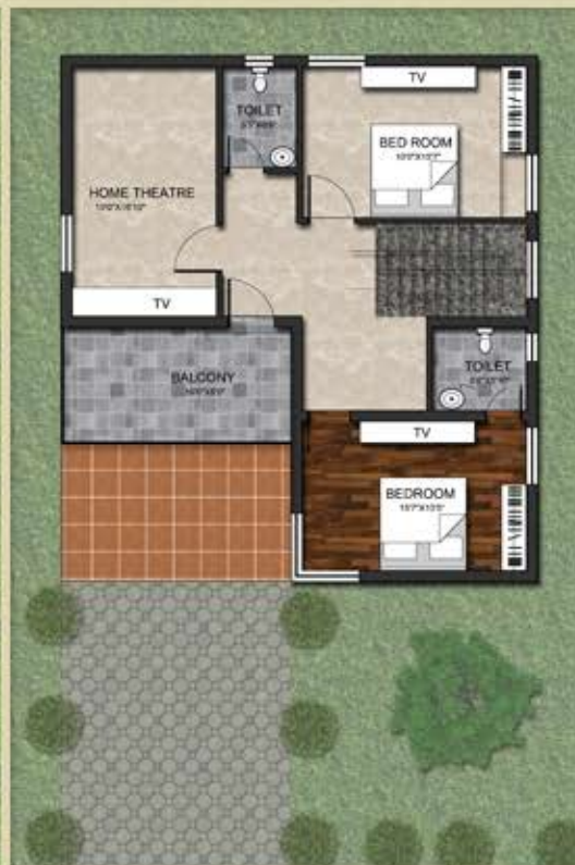
SOUTH - First Floor