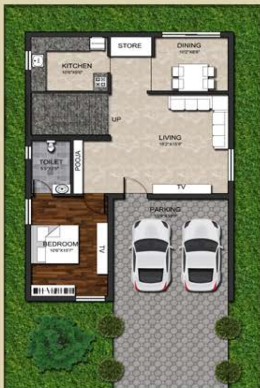
SOUTH - Ground Floor