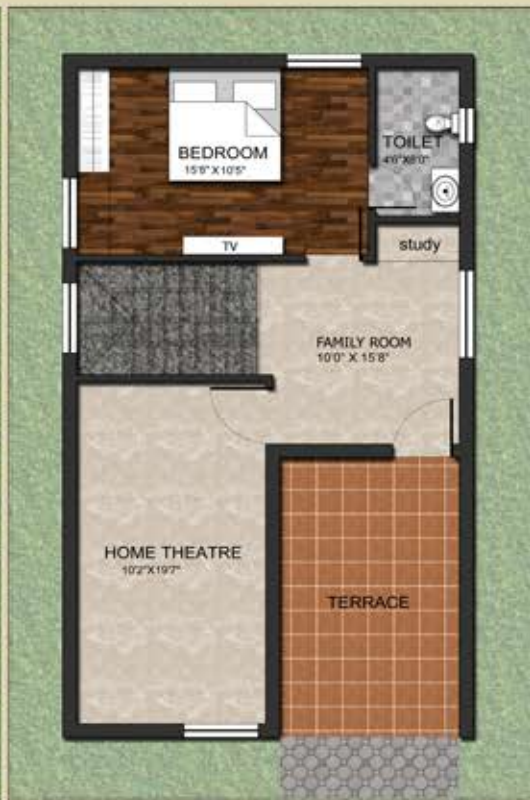
EAST - First Floor