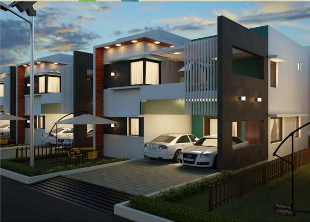
30' Feet Road Elevation