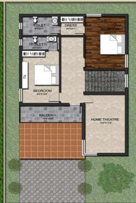
NORTH - First Floor