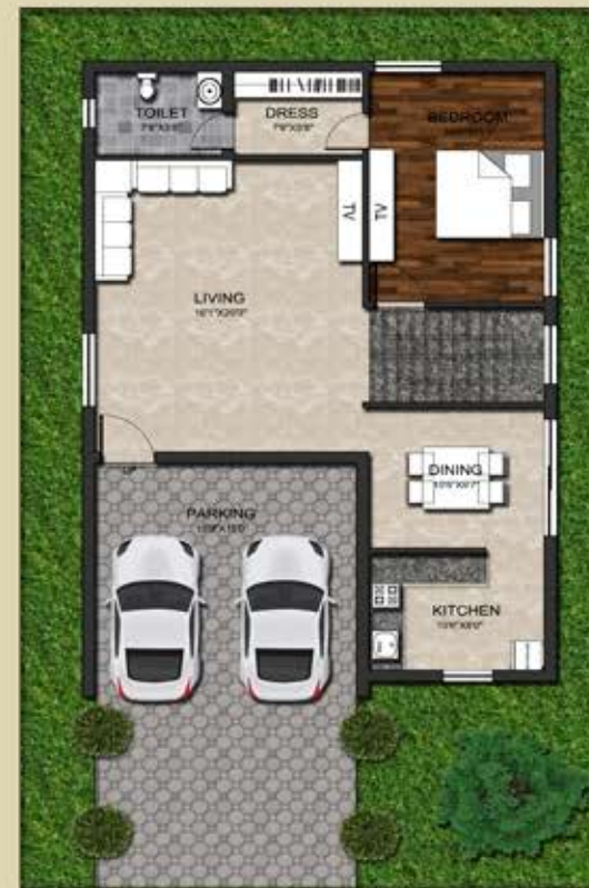
NORTH - Ground Floor