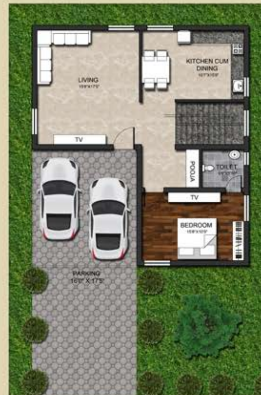
WEST - Ground Floor